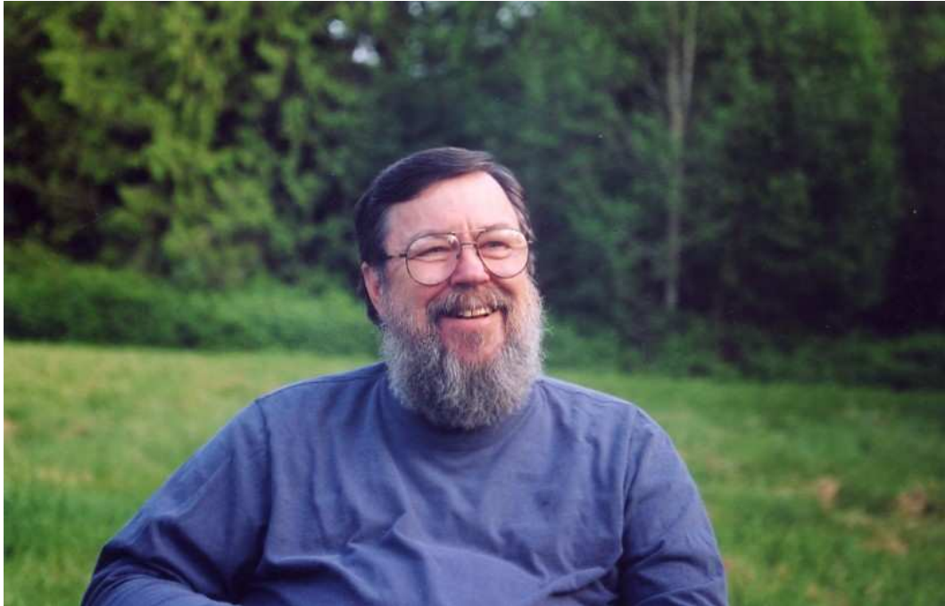
CONSUMMATE WOODTURNER ARTIST, TEACHER, FRIEND